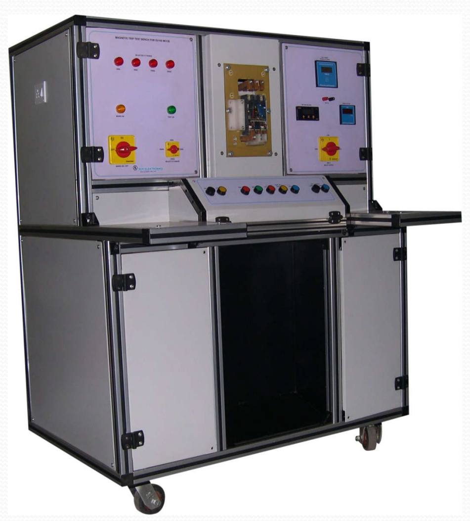
MCCB Short Circuit Trip Verification Test Bench