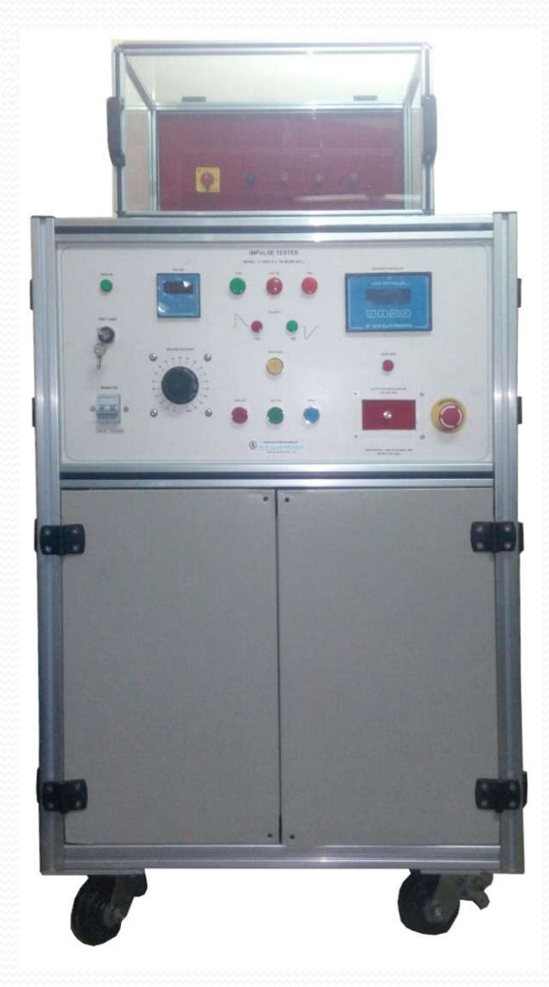
Fig. Impulse Tester 15kV