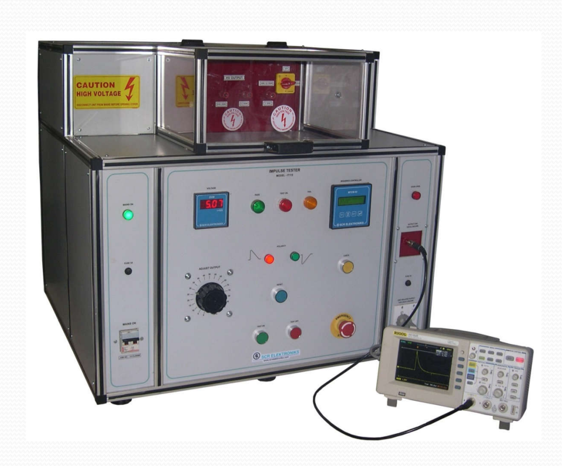
Fig. Impulse Tester 10-12V