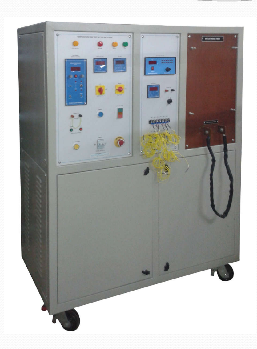
MCCB Temperature Rise Test Bench